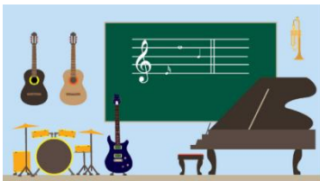
4. music room